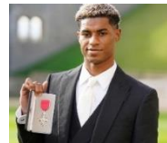
Alexander Graham Bell