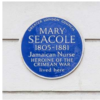
Blue Plaque commemorating Mary Seacole's life.