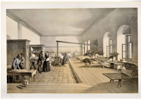
Scutari Hospital that Florence Nightingale helped to improve in 1854.