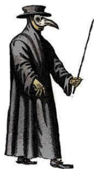
A Plague Doctor