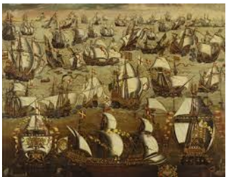
The Spanish Armada