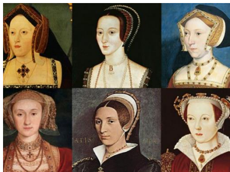
The Six Wives of Henry VIII: Catherine of Aragon, Anne Boleyn, Jane Seymour, Anne of Cleves, Catherine Howard, Catherine Parr.