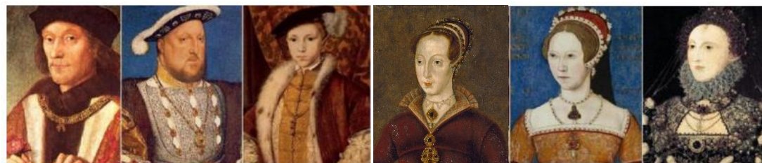
King Henry VII King Henry VIII King Edward VI Lady Jane Grey Queen Mary I Queen Elizabeth I