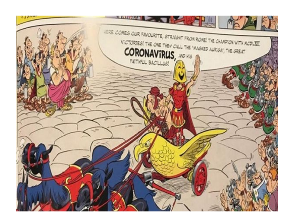
Image from Asterix book 2017! Cornavirus as a masked Roman villan!

Phone: 020 7485 2155 Email: head@eleanorpalmer.camden.sch.uk